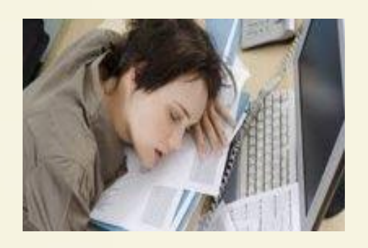
More information in the <u>assistant's guide</u>

In case of serious illness you must inform your school and also the Ministry.